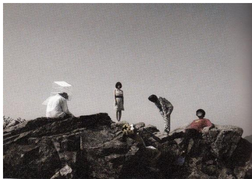
Fig. 5. Production Still (Yeoncheon Hill) from Sindoan .