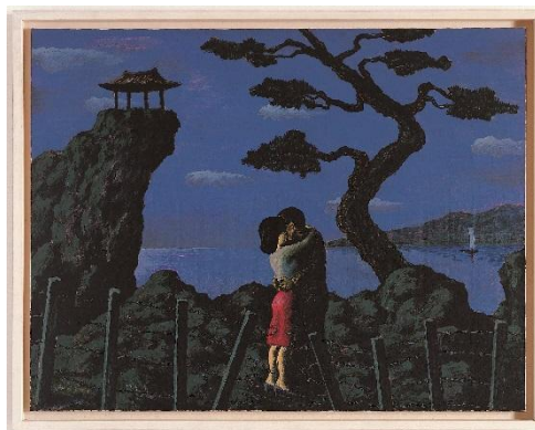
Fig. 6. Min Jeong-gi, Hugging , 1981, Oil on canvas, 145.5 cm x 112cm.

Park Chan-kyong himself explains this sense of alienation, the feeling that something is not “right” in Min’s painting through the notion of a makeshift stage (C. Park, “Poong” n. pag.). Park speculates that if one removed the couple from the painting, the work would function more like a background, as in an old photo studio or on a theater stage, than like an independent painting. Park’s reference to a stage in effect implicates Min’s long involvement in theater and his art’s reputation as being “barbershop painting,” appropriated from kitschy paintings found in barbershops and chop houses, apparently in contrast to “the serious face and authority” of institutional