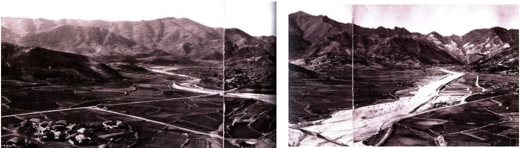
Fig. 1. Photographs of Sindoan, from Sindoan . Still image courtesy of the artist Park Chan-kyong.

had been silenced by such oppressive modern forces as the Japanese colonial government (1910-45) and the dictatorial Korean government. In so doing, he seeks to help viewers understand the true nature of Korean modernity, and the collective experience and psyche of Koreans shaped by a distant past which so diverges from the official narratives of modern Korean history.